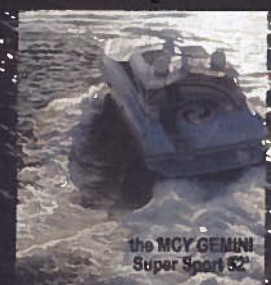
the MCY GEMINI Super Sport 52'

Introducing the MCY Gemini 60' at the Fort Lauderdale International Boat Show - SLIP G 721