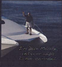
The Twin Hull Gemini and your wish to own a dream.

We are a visionary company with ideas backed by one of the most experienced teams in the yacht building business.