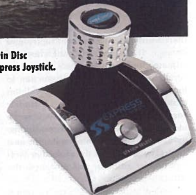
Twin Disc Express Joystick.