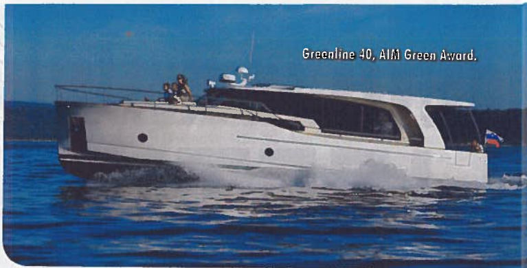
Greenline 40, AIM Green Award.

A donation from the Editor's Choice Awards was made to Nova Southeastern's Oceanographic Center, home of the new 86,000-square-foot Center of Excellence for Coral Reef Ecosystems Research, built on a 10-acre campus next to John U. Lloyd State Park in Dania Beach. It will be the focal point for local, regional, national and international research into coral reefs and the study of solutions for coral reef decline. ■