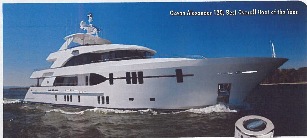
Ocean Alexander 120, Best Overall Boat of the Year.

AIM Marine Group Editor's Choice Awards recognize top boats, achievements and more