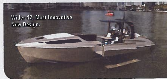
Wider 42, Most Innovative New Design.