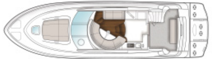
Upper Cabin/Cockpit Layout