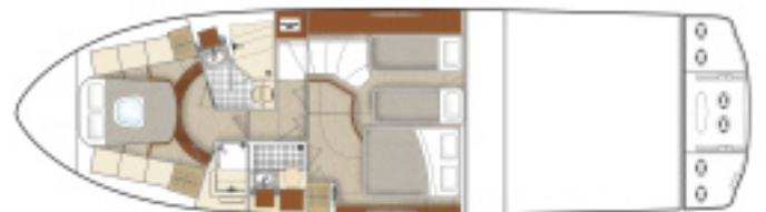
Three Stateroom Option