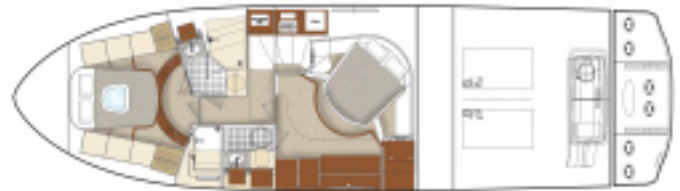
Lower Cabin Layout