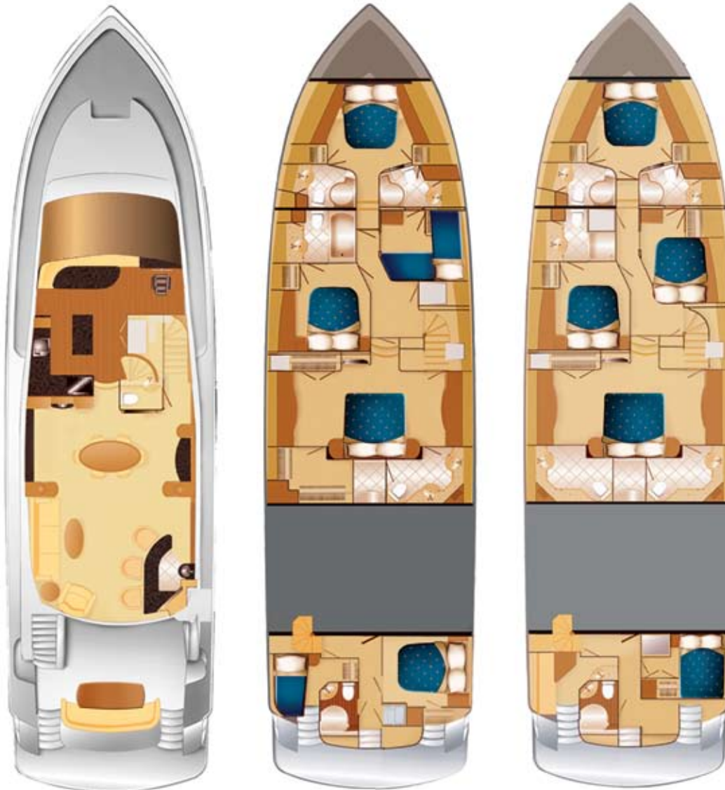
Optional Upper Deck Arrangement with Lower Helm and Sunken Bar