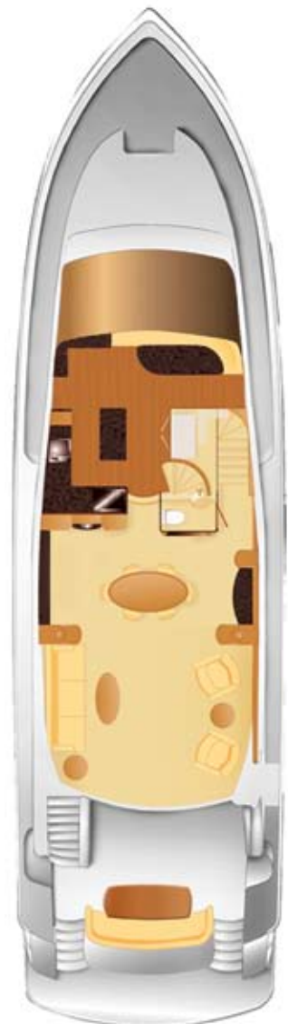
Standard Upper Deck Arrangement