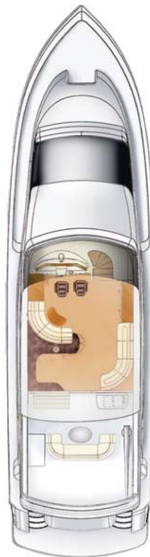
Optional Enclosed Bridge Arrangement