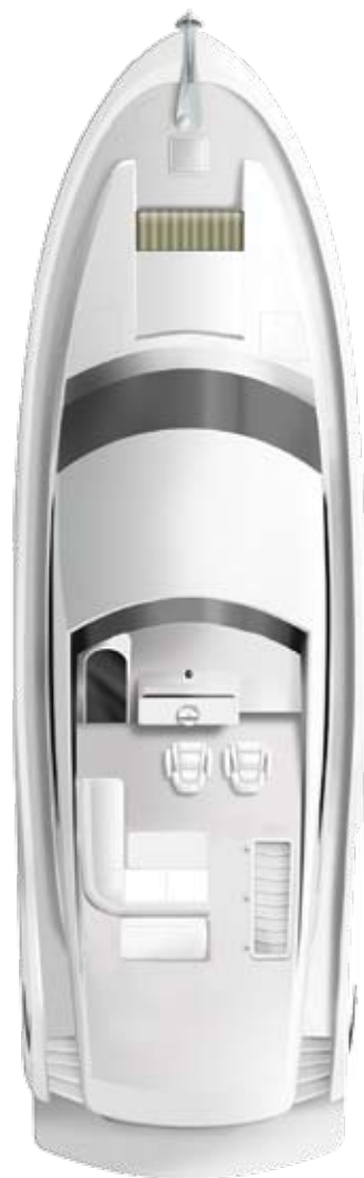
Standard Flybridge Arrangement