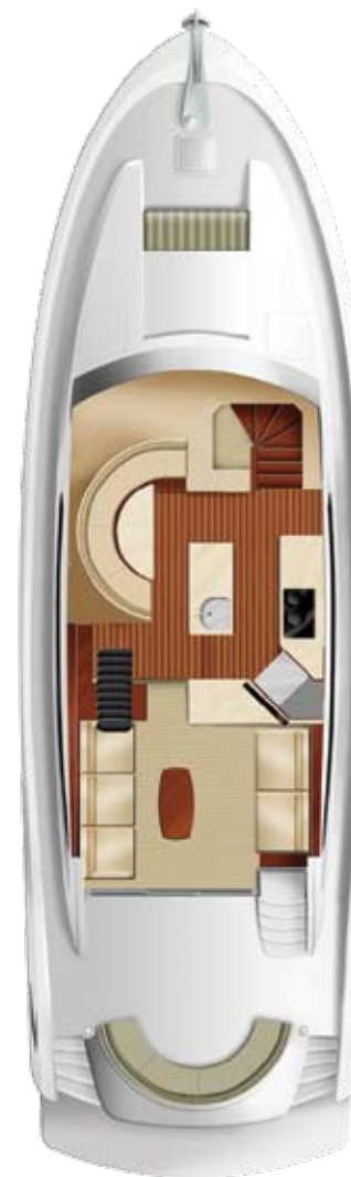
Standard Upper Deck Arrangement