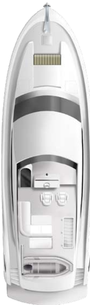
Optional Flybridge Arrangement with Davit