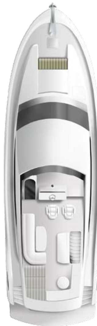
Optional Flybridge Arrangement with Bench Seating and Sunpad