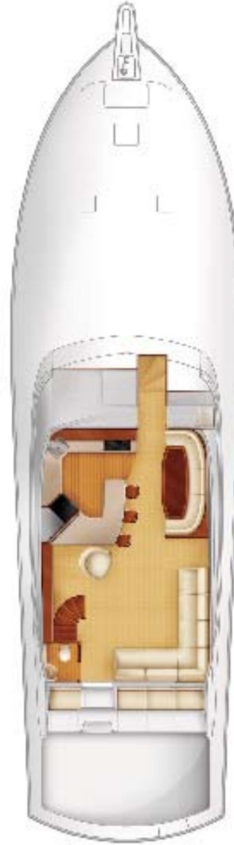
Standard Upper Deck Arrangement