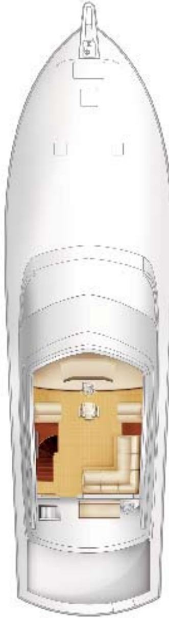
Standard Enclosed Flybridge