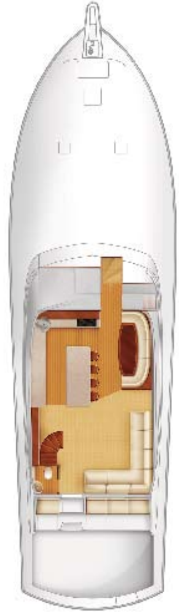
Optional Upper Deck Arrangement with Galley Island