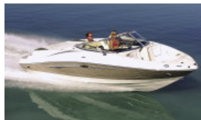
The Sea Ray 210 Select's 5.0-liter engine gives a smooth performance.

There was no print through — that messy look of structural fiberglass rip-