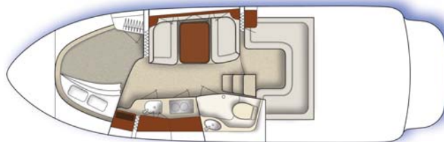
Cabin Layout w/Salon/Dinette (A)