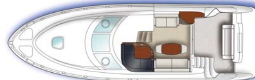
Upper Cabin/Cockpit Layout

(Shown w/Optional Salon Table and Aft Bench Seat)