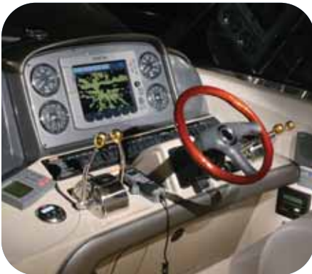
Fully equipped control station features SmartCraft™ instrumentation and System View plus wood-accented tilt wheel steering with optional Raymarine Dual E120 networked GPS/chartplotter radar.

This exciting new 38 Sundancer features a stylish new fiberglass hardtop with aft sunshade, overhead lighting and stainless-steel grab rails. An innovative center door in the transom provides easy access to the luxuriously appointed cockpit, complete with Corian® table top, wet bar and icemaker. Powered by twin 8.1 S Horizon MerCruiser® V-drives, this robust Sport Yacht offers a two-year limited engine warranty, underwater exhaust, and standard anchor washdown.