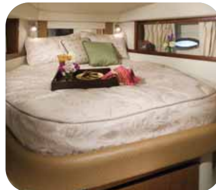
This handsome forward stateroom includes a full-size bed with innerspring mattress, sliding pocket privacy door, mirrored hanging locker with light, and 17" flatscreen TV with DVD player.