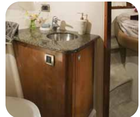
A separate shower and dual-entry head provides both privacy and comfort. Designer extras include solid-surface countertop, stainless-steel handrails, and handcrafted wood trim.

Sea Ray Boats, 2600 Sea Ray Blvd., Knoxville, TN 37914. For information call 1-800-SRBOATS or fax 1-636-326-3282. Internet address: http://www.searay.com Note: Not all accessories shown in pictures or described herein are standard equipment or even available as options. Options and features are subject to change without notice. Not all model year boats may contain all the features or meet the specifications described herein. Confirm availability of all accessories and equipment with an authorized Sea Ray dealer prior to purchase. Printed in the U.S.A. November 2005 ©Sea Ray Boats. PUB120805