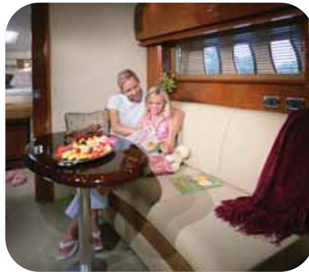
Large hull windows fill this elegant salon with plenty of light. Upgraded amenities include wood blinds and an Ultraleather HP™ sofa that converts to an extra guest bed.