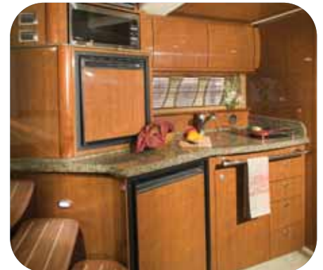
Wood steps lead gracefully into this gourmet galley, which features an under-counter refrigerator and separate freezer, two-burner stove, microwave, solid-surface countertop, wood blinds, and extra-large windows.