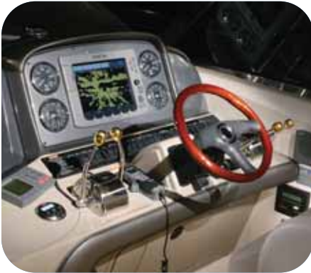
Fully equipped control station features SmartCraft™ instrumentation and System View plus wood-accented tilt wheel steering with optional Raymarine Dual E120 networked GPS/chartplotter radar.

This exciting new 38 Sundancer features a stylish new fiberglass hardtop with aft sunshade, overhead lighting and stainless-steel grab rails. An innovative center door in the transom provides easy access to the luxuriously appointed cockpit, complete with Corian® table top, wet bar and icemaker. Powered by twin 8.1 S Horizon MerCruiser® V-drives, this robust Sport Yacht offers a two-year limited engine warranty, underwater exhaust, and standard anchor washdown.