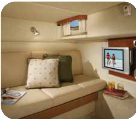
Convenient mid-stateroom includes a cozy conversation pit that converts to a double berth. Additional features include stainless-steel portlight, privacy curtain, and optional 14" flatscreen TV with DVD player.