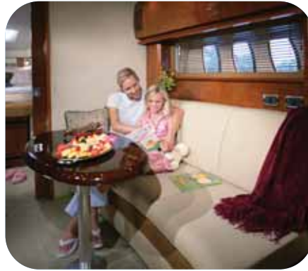
Large hull windows fill this elegant salon with plenty of light. Upgraded amenities include wood blinds and an Ultraleather HP™ sofa that converts to an extra guest bed.