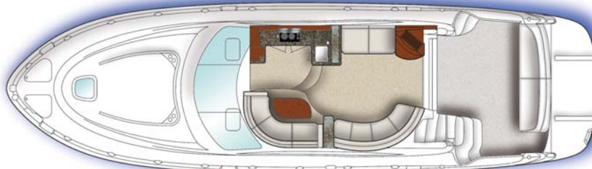
Upper Cabin/Cockpit Layout