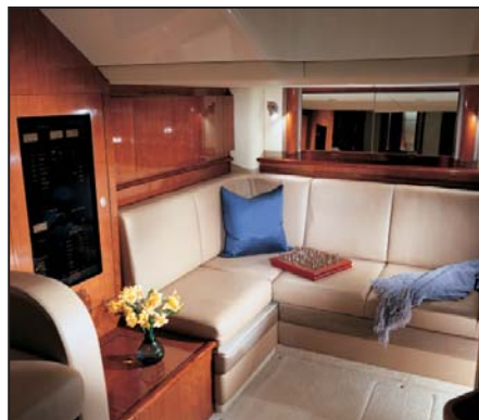
Conversation area converts to comfortable stateroom with slide-out bed, privacy curtain, and lots of storage.