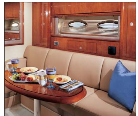
Glove-soft Ultraleather HP™ sofa makes this versatile salon both elegant and comfortable. Extras include wood blinds and high-gloss wood table.

Sea Ray Boats, 2600 Sea Ray Blvd., Knoxville, TN 37914. For information call 1-800-SRBOATS or fax 1-636-326-3282. Internet address: http://www.searay.com Note: Not all accessories shown in pictures or described herein are standard equipment or even available as options. Options and features are subject to change without notice. Not all model year boats may contain all the features or meet the specifications described herein. Confirm availability of all accessories and equipment with an authorized Sea Ray dealer prior to purchase. Printed in the U.S.A. July 2004 ©Sea Ray Boats.