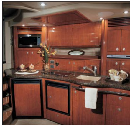
Fully equipped galley boasts handcrafted cabinets, solid surface countertop, touch pad two-burner stove, plus under-counter refrigerator and freezer.