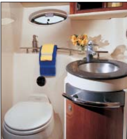
Accessible from both the forward stateroom and salon, this roomy head compartment features designer vanity, stainless steel handrail, and large, VacuFlush® toilet.