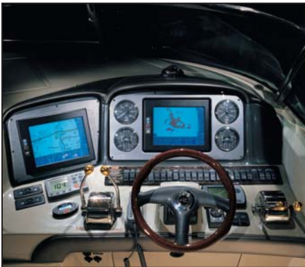
Nickel-tone gel-coated dash features a full complement of SmartCraft™ diagnostic instruments, illuminated weatherproof switches, and a wood-accented steering wheel.

With its sweeping deck lines and dramatic profile, this elegant new 390 Sundancer is sure to get noticed. This newest addition to the Sundancer family features a sleek, wood-trimmed helm with custom-designed instruments, plus an optional fiberglass hardtop. Engineered to outpace every other boat in its class, the 390 Sundancer offers a spectacular combination of style, power and grace.