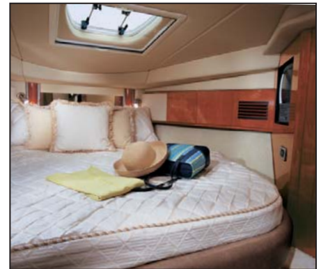
Forward stateroom includes full-size bed with innerspring mattress, mirrored locker, 13" TV/DVD player, and sliding pocket door.