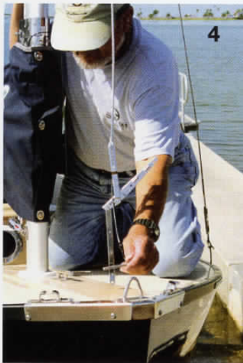
4 Attach the forestay tang to the sternhead with the quick-clevis pin.