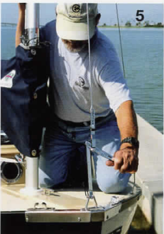
5 Tension the rigging by simply pulling down on the forestay self-locking lever.