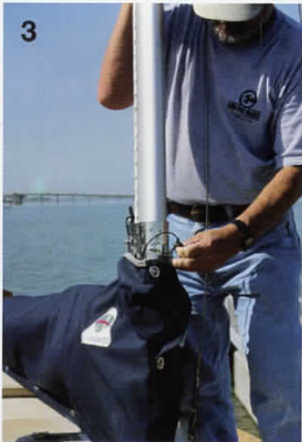
3 Insert the mast-hinge lock pin.