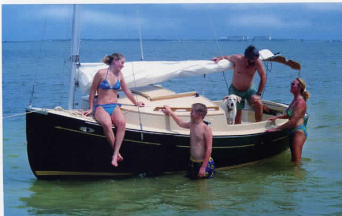
Come on in; the water's perfect ... and it's only knee deep.

The advantages of the Sun Cat's shoal draft configuration are many, and are envied by deeper-draft sailors. You can slip into peaceful back bays and tide waters, or nose up to a beach and step over the side. Beach combing has never been easier! And trailer launching from most any ramp is a cinch.