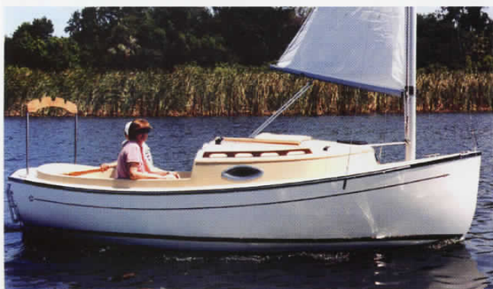
Just ghosting along to the whisper of the bow wave and the hum of the dragonflies. It's sure good to get away from the office!

The result of Clark's effort is the Sun Cat ... an easily driven and roomy daysailer and overnigher. The Sun Cat 's shoal draft can gunkhole along coasts and in harbors not accessible to more burdensome yachts. It is conveniently trailered and beached. Best of all, the Sun Cat sails really well. It is also very stable and moves easily into a choppy sea.