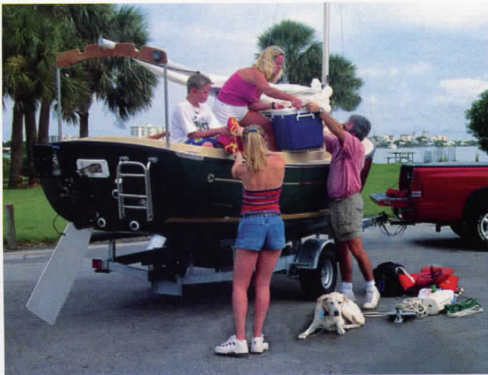
At 2,000 pounds total trailering load, the Sun Cat is easily hauled with a mid-size sedan or small truck, putting you in convenient range of your favorite bays, lakes, and waterways.