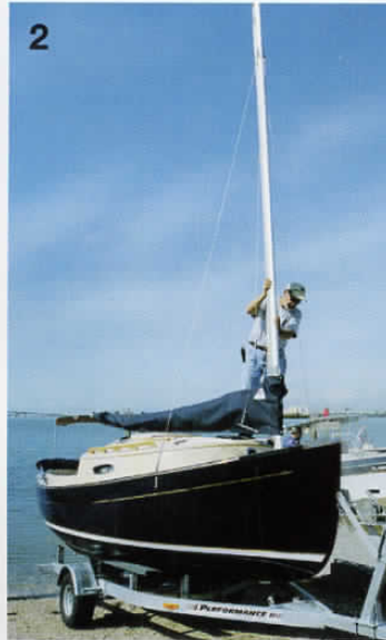
1 & 2 Untie and lift the mast to vertical.