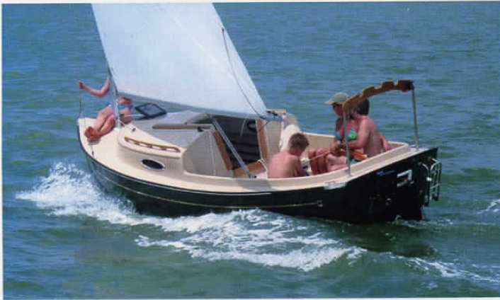
Whoeeeeee ... Look at us go! What a great way to spend an afternoon.

The advantages of the Sun Cat's shoal draft configuration are many, and are envied by deeper-draft sailors. You can slip into peaceful back bays and tide waters, or nose up to a beach and step over the side. Beach combing has never been easier! And trailer launching from most any ramp is a cinch.