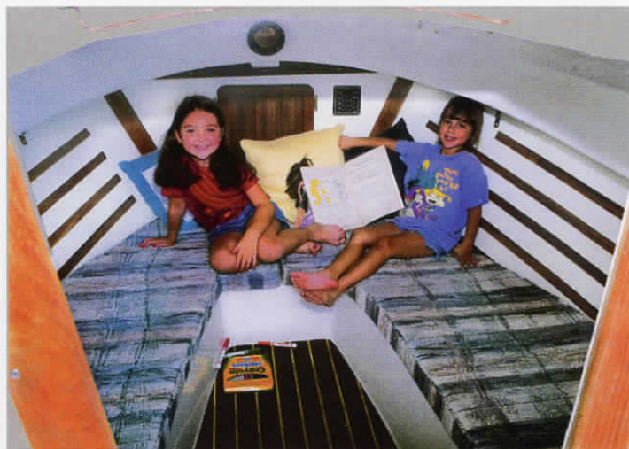
The cozy Sun Cat cabin has plenty of space for your friends and lots of stuff.

Teak trim, cabin sole, hatch boards and hull-ceiling strips give the Sun Cat the look and feel of the finest marine tradition. Quality upholstery promises comfort as well as good looks.