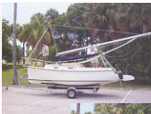
OK...up she goes.