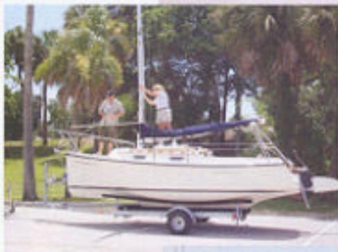
That was easy!