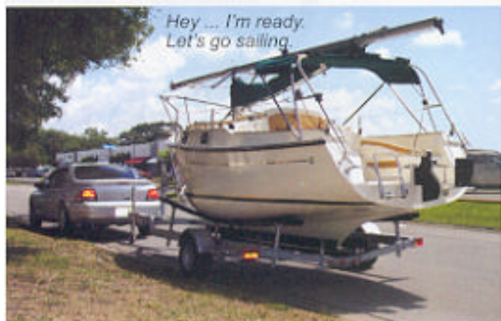
Hey ... I'm ready. Let's go sailing.

The Hutchins Company has developed an exclusive rapid-setup rigging system that allows for single-handed mast raising and tuning, eliminating the major hassles of most trailer sailing. From arrival at the ramp to launch is only a matter of several minutes ... not a half hour! The standing rigging is pretensioned and tuned using quick-release tensioning levers to dispense with time-wasting turnbuckle twisting. The boom-vang tackle and temporary stainless steel strut are used to raise the mast with ease.