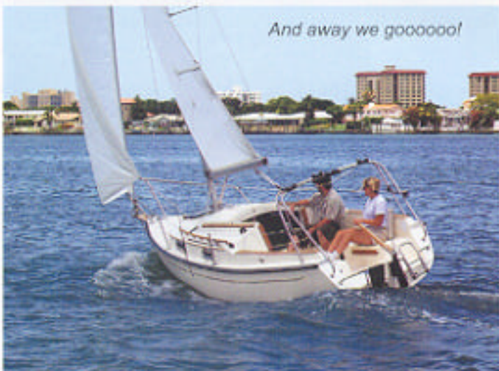
From trailer to sailing in less than ten minutes!