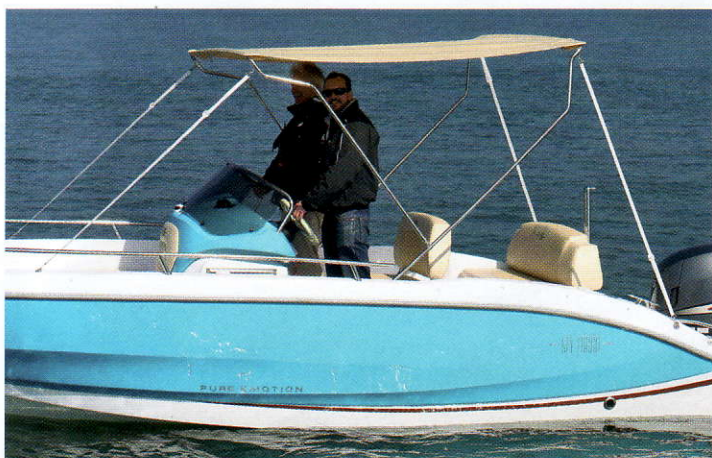
For a bit of sun protection, pull out the Bimini hidden under the forward sunpad

ENQUIRIES Bates Wharf Tel: 01932 571141 www.bateswharf.co.uk