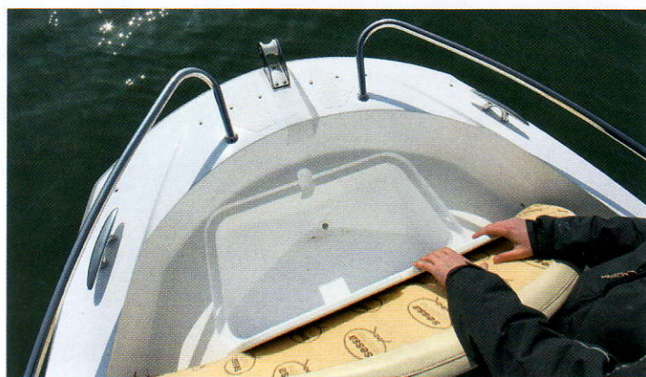
This moulded-out locker has a drain hole, so is ideal for wet gear

good across the boat with various through-bilge and lined out lockers to swallow up your gear.