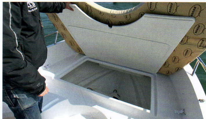
The Key Largo One has a number of through-bilge lockers

“The Key Largo One practically begs you to smile”