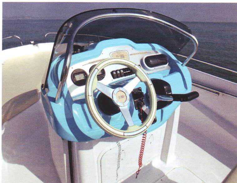
The eye-catching, bright blue centre console sets this sportster apart from the rest

This looks like the perfect recessionary antidote. Can the Key Largo One spice up the starterboat market like the Fiat 500 did for super-mini cars?