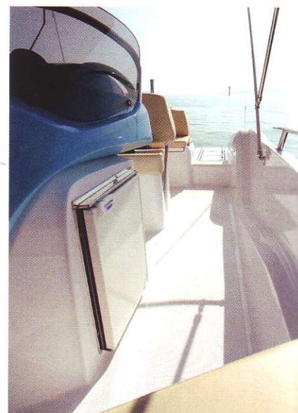
Wide decks and a hide-away optional fridge