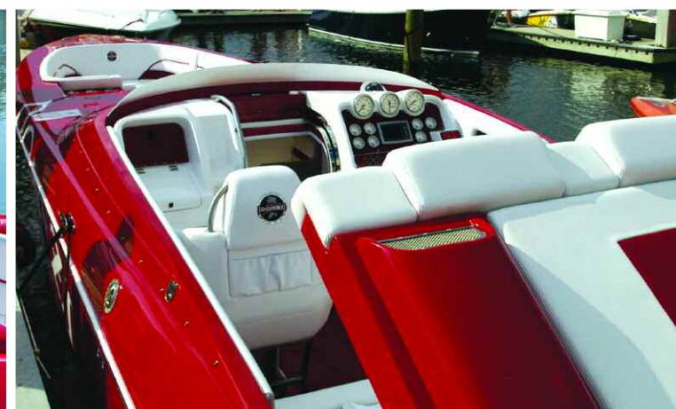
The 35' Donzi ZR ready for its test.