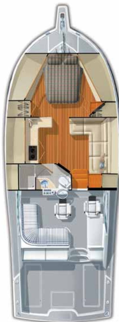
Standard 1-Stateroom / 1-Head Arrangement