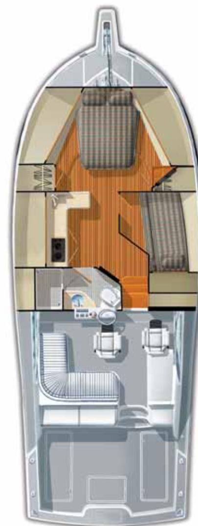
Optional 2-Stateroom / 1-Head Arrangement