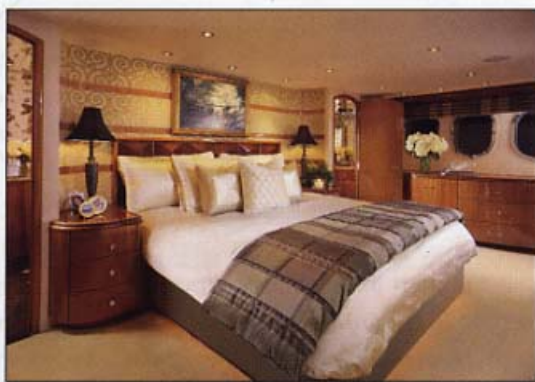
Capable of 25 knot speeds, the 80 goes as good as it looks. All the staterooms and the salon are spacious, while the helm affords great visibility.