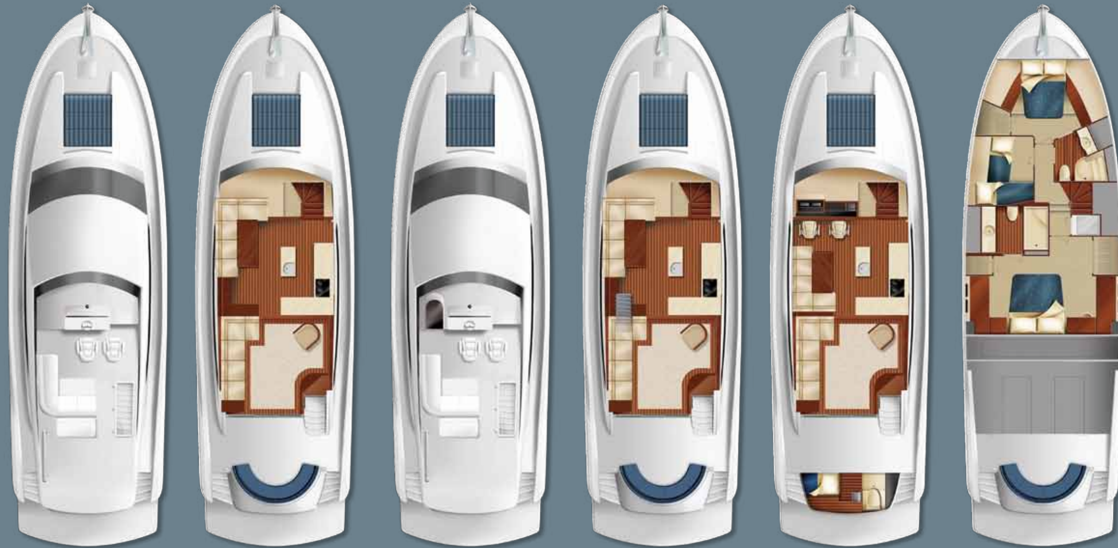
Standard Flybridge Arrangement